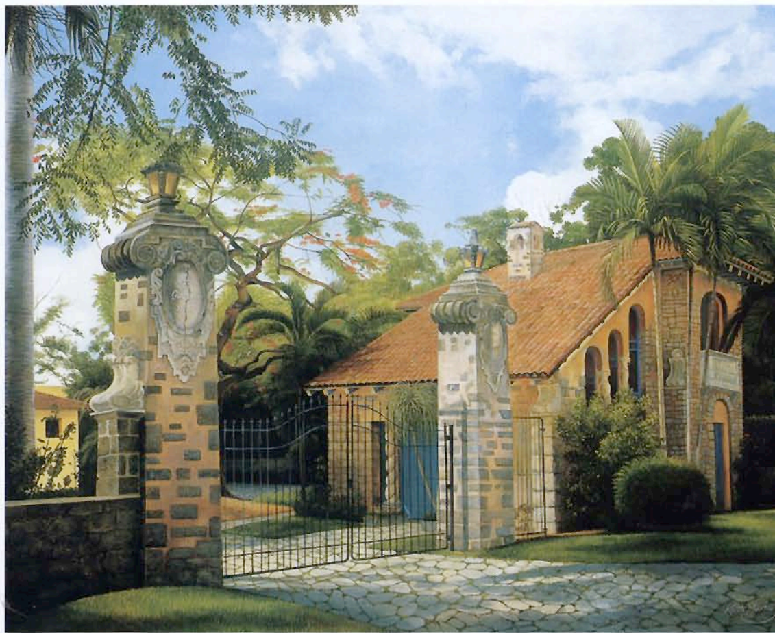
In Gates of Splendor, the entrance to a private school is embellished by a poinsettia tree in bloom.